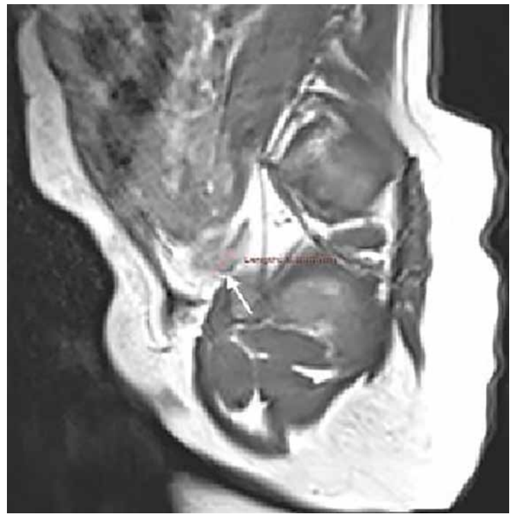
Figure 1: MRI of the pelvis demonstrating the presence of the left testis in the pelvis, near the leftinguinal canal.

At the third visit, when the child was nine months old, we could not palpate the testis in the inguinal canal. Ultrasound showed it to be close to the internal inguinal orifice, which was confirmed by pelvic MRI, and it was smaller than the contralateral testis (Figure 1).