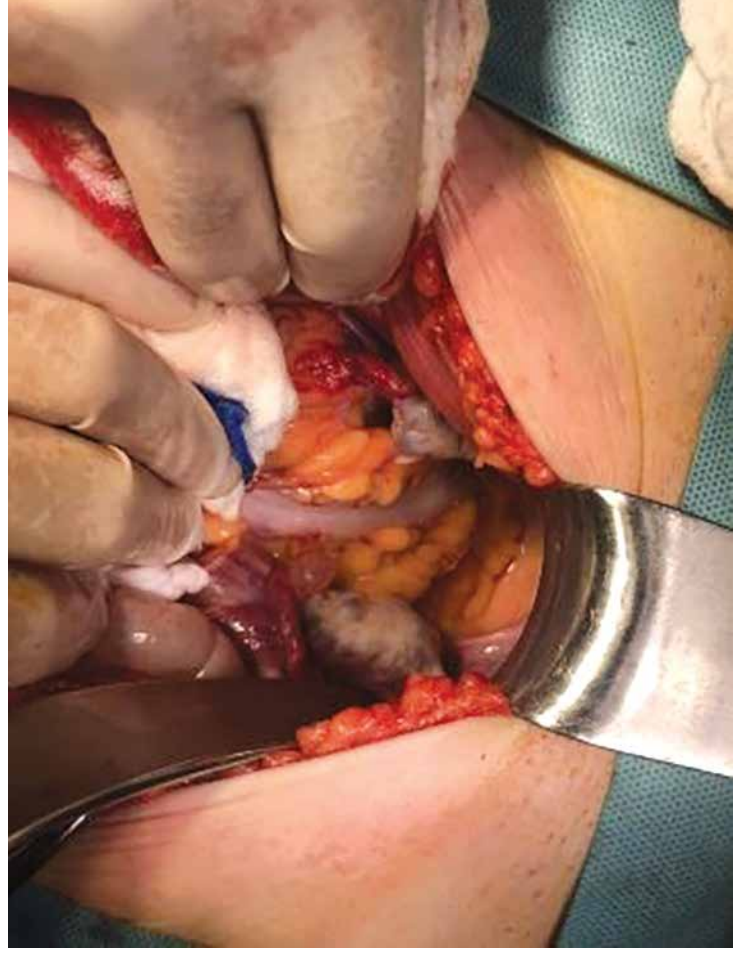
Figure 2: Intraoperative view of Mayer-Rokitansky-Kuster-Hauser